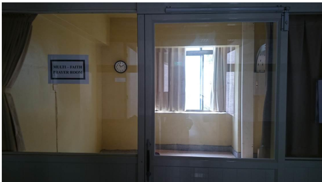
鴻齋內 2 樓和 7 樓設有祈禱室。